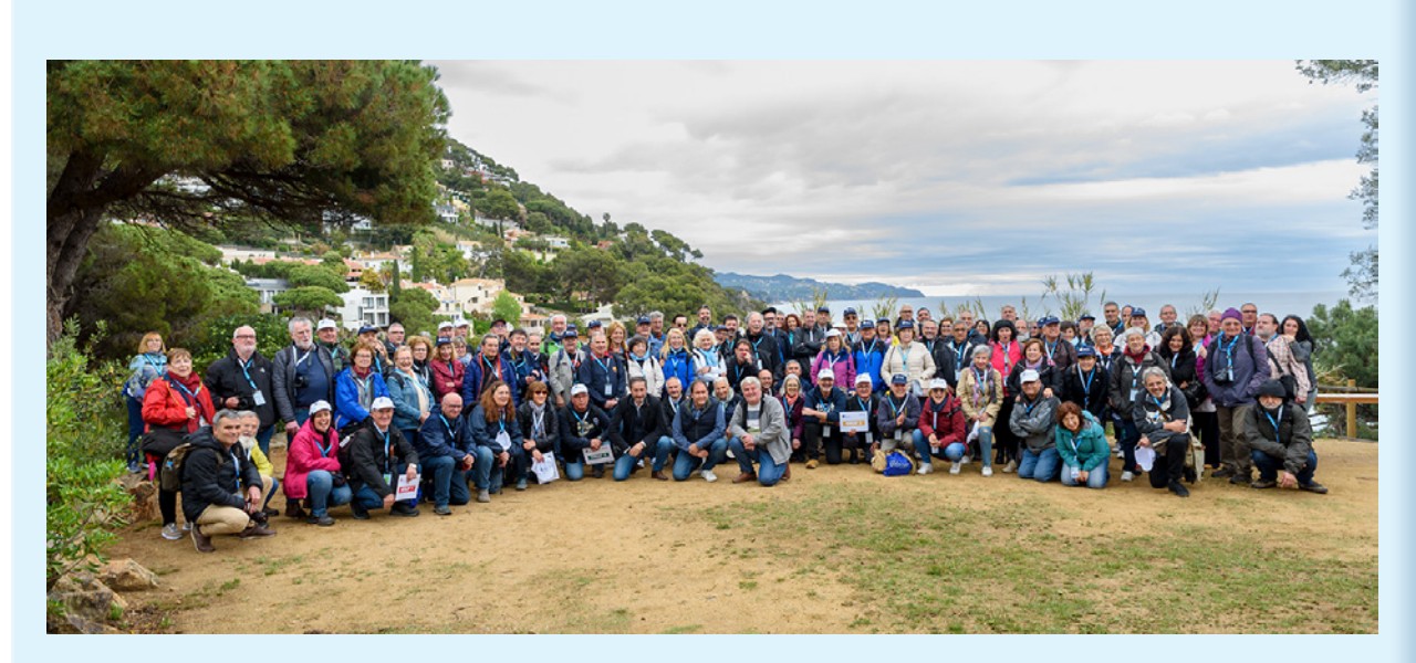
Group photo of those attending the Photography Festival

The day was a success. About 150 photographers from all over Catalonia participated and enjoyed more than 16 hours of activity and photographic friendship.